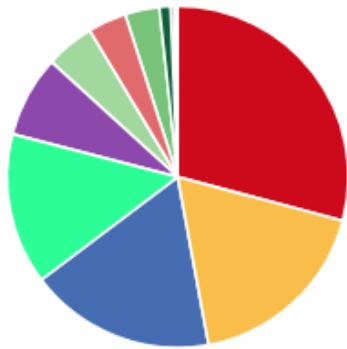
My practice (215.44 cases per FTE)